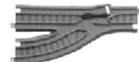
F Switch Track (Left) x 1